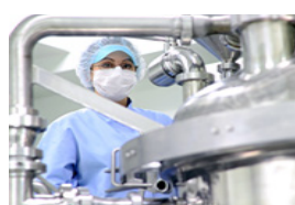
Laboratories & Clean Rooms