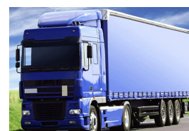
Service, Maintenance & Calibration