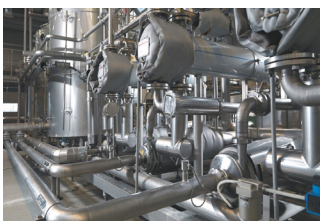
Food & Beverage

A world leader in digital thermometers, Rototherm has become the standard for accurate and reliable measurement across the following industries: